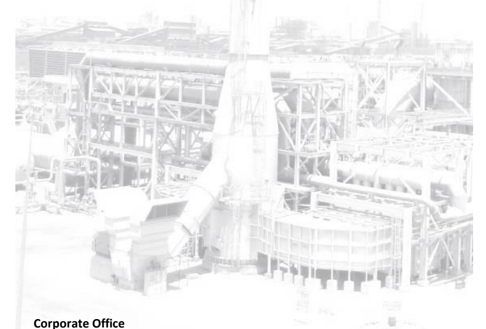
7785 Foundation Dr, Ste. 200 Florence, KY 41042